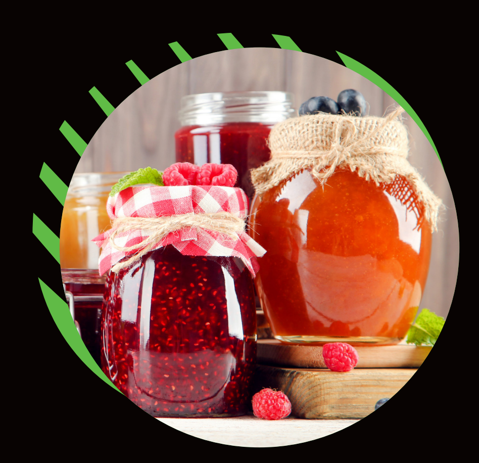
Jams and purees